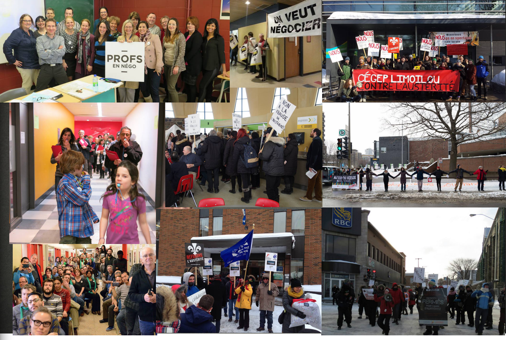
Across Quebec, February 23 to 28, CEGEP teachers rallied against austerity measures and in support of their bargaining committee.